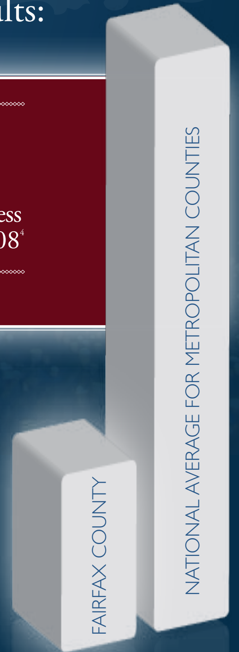
VIOLENT CRIME COMPARISON

Gerry Connolly knows NOTHING IS MORE IMPORTANT THAN KEEPING OUR COMMUNITIES SAFE.